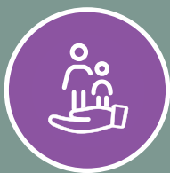
Maternal child health