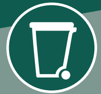
Rubbish bin collections