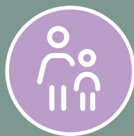
Family day care services