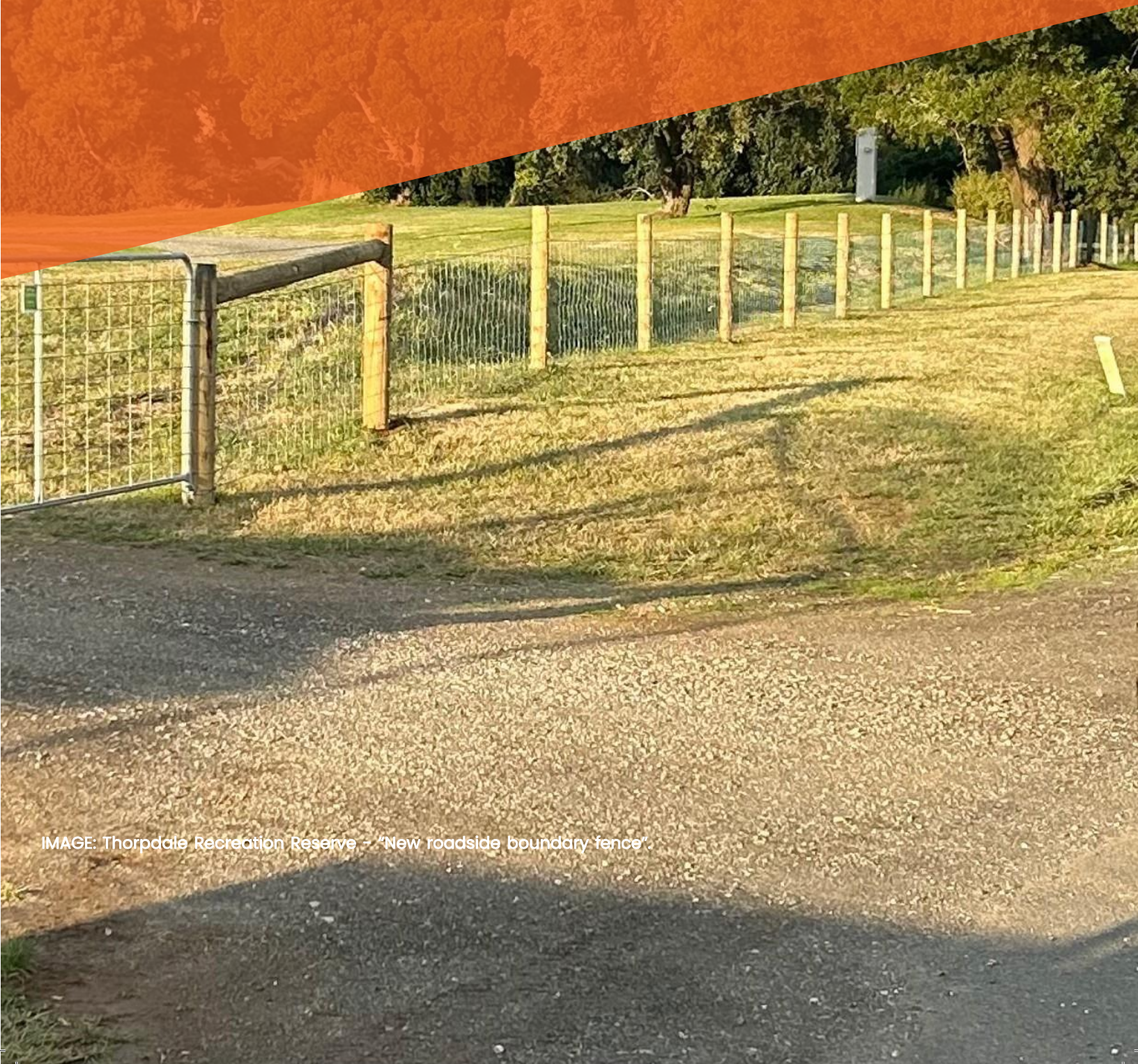
IMAGE: Thorpdale Recreation Reserve - "New roadside boundary fence".