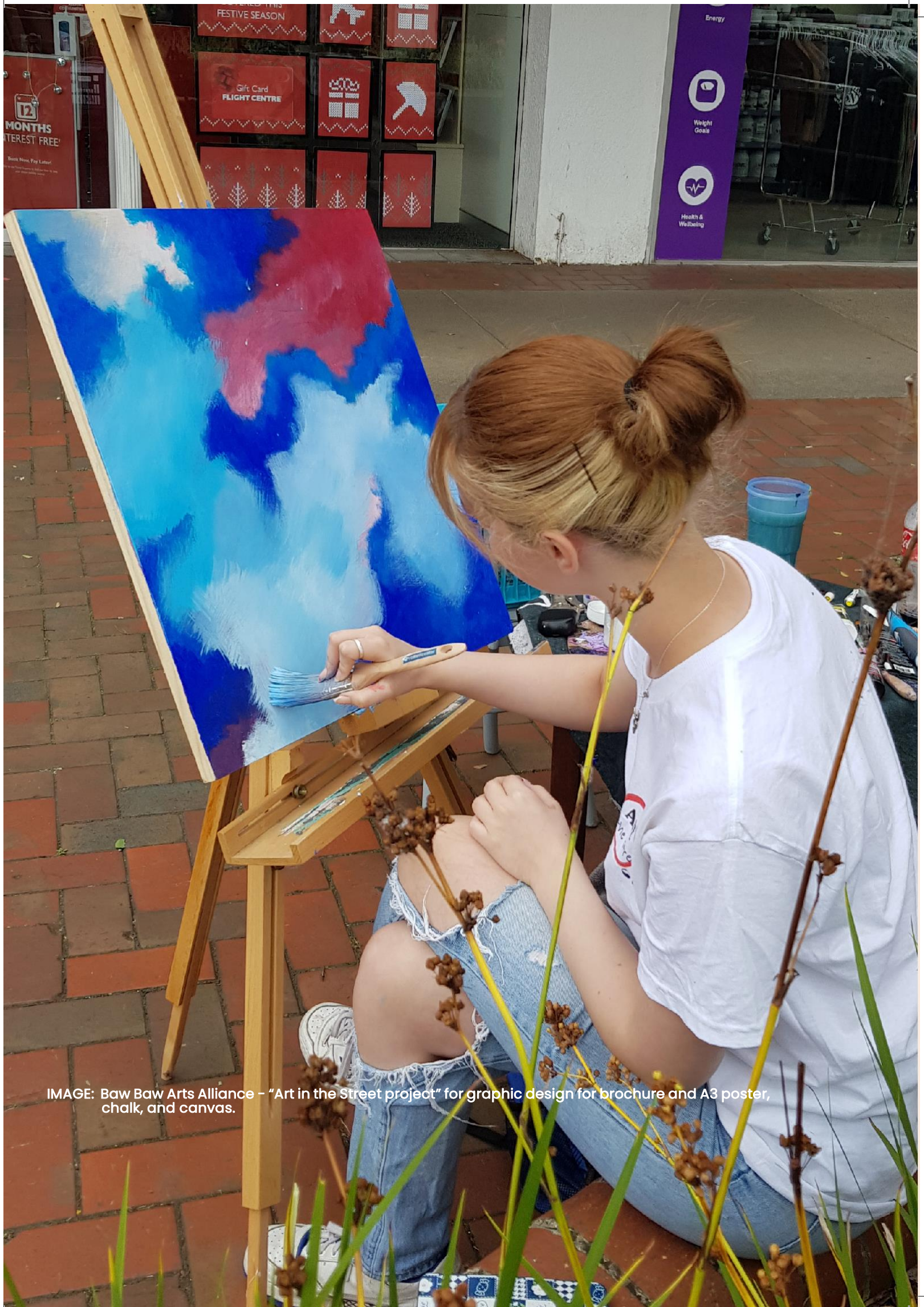
IMAGE: Baw Baw Arts Alliance – “Art in the Street project” for graphic design for brochure and A3 poster, chalk, and canvas.