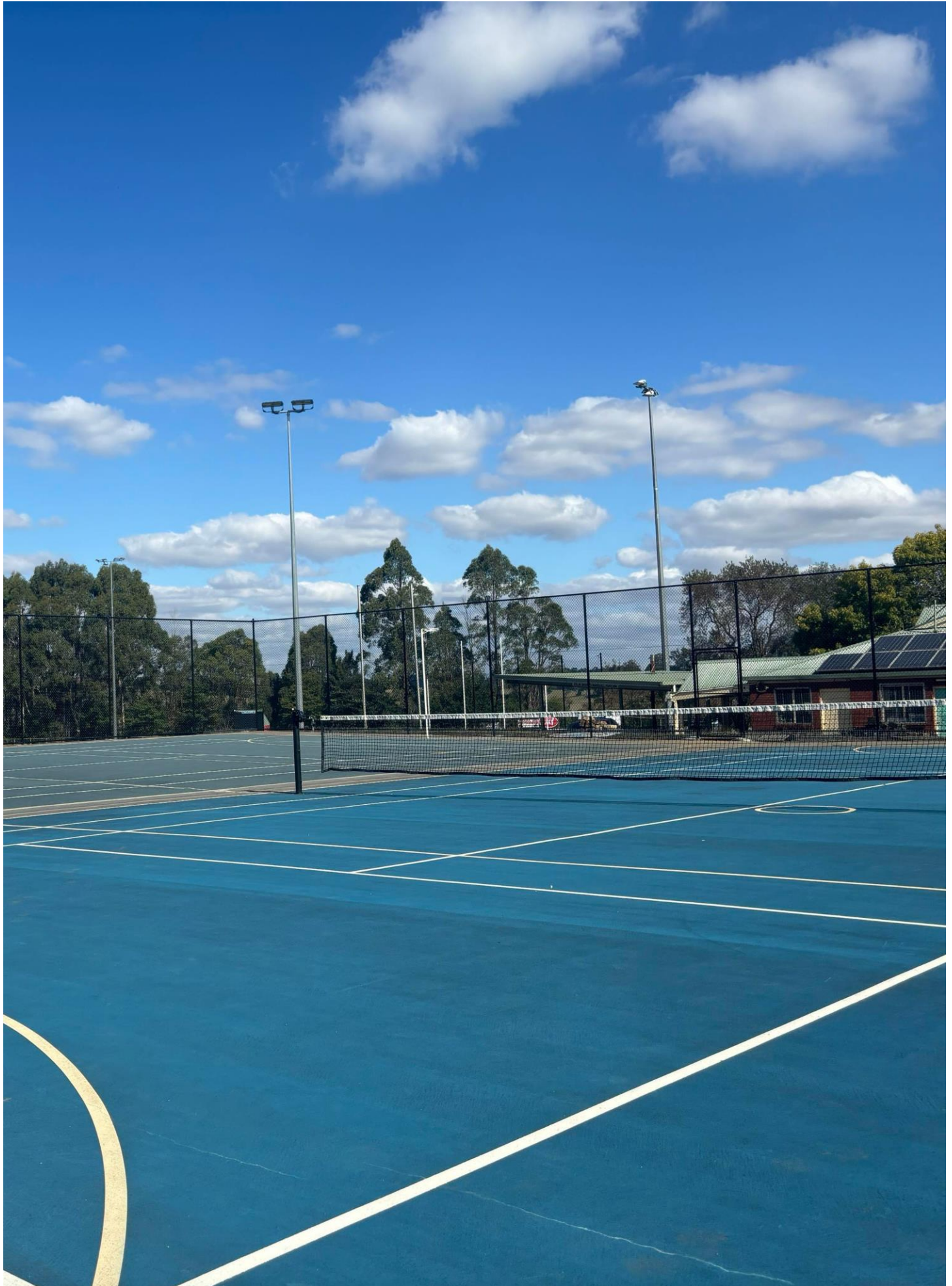
IMAGE: Neerim-Neerim South Football and Netball Club - "Netball & Tennis Court Fence Renewal Project" to replace the existing Netball and Tennis court fence on the North, South and East sides of the courts at the Neerim South Recreation Reserve.