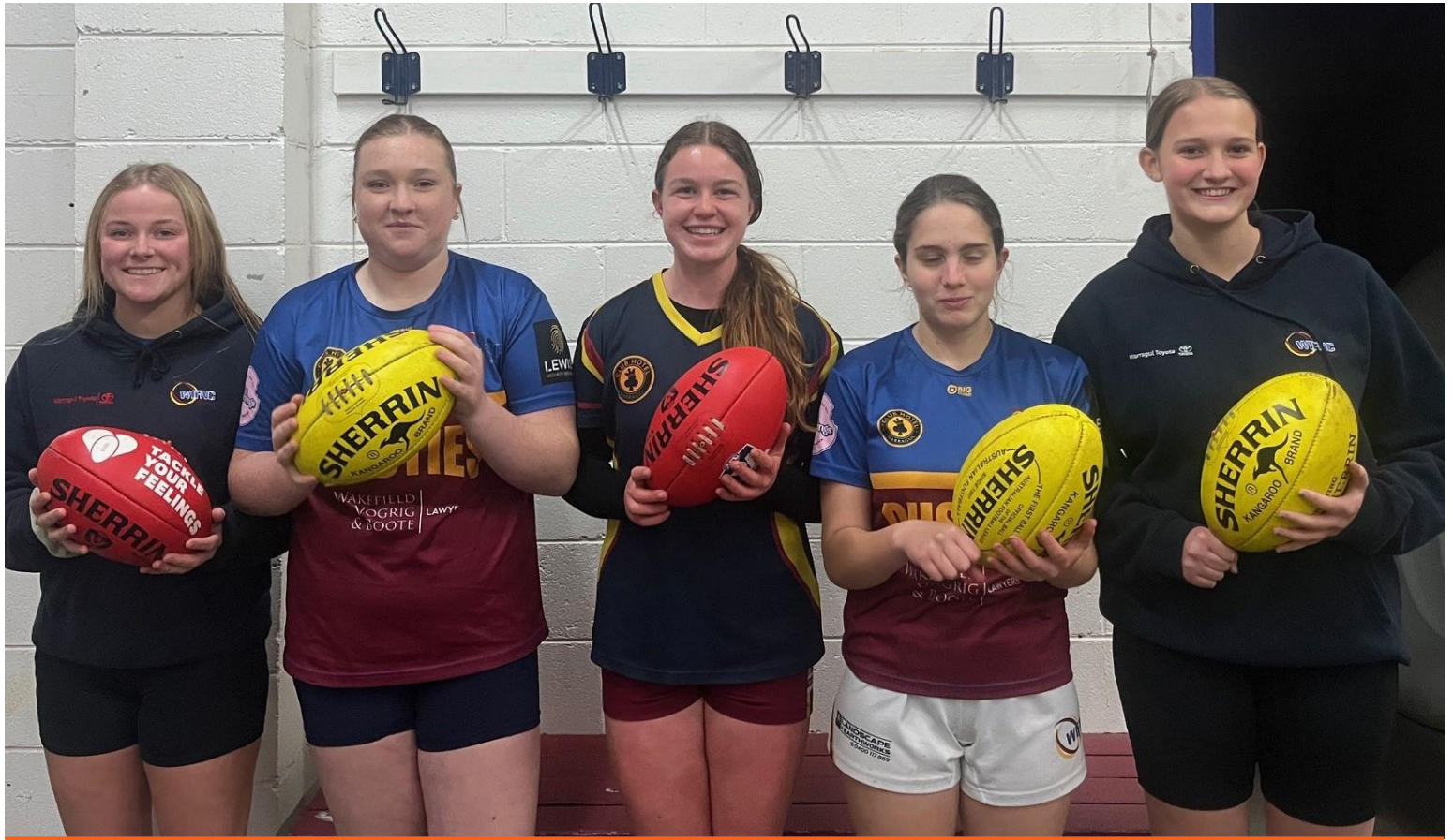
IMAGE: Warragul Industrials Football Netball Club - for the purchase of 30 footballs.