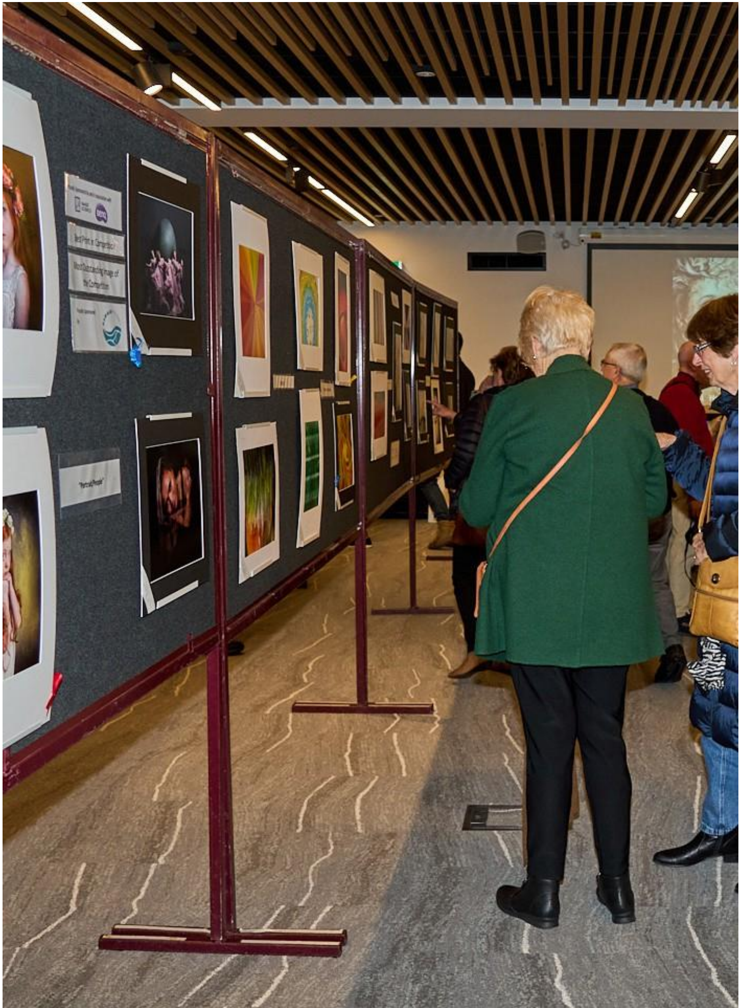
IMAGE: Warragul Camera Club – “51st Warragul National Photographic Competition and Exhibition Event” for catalogue advertising.